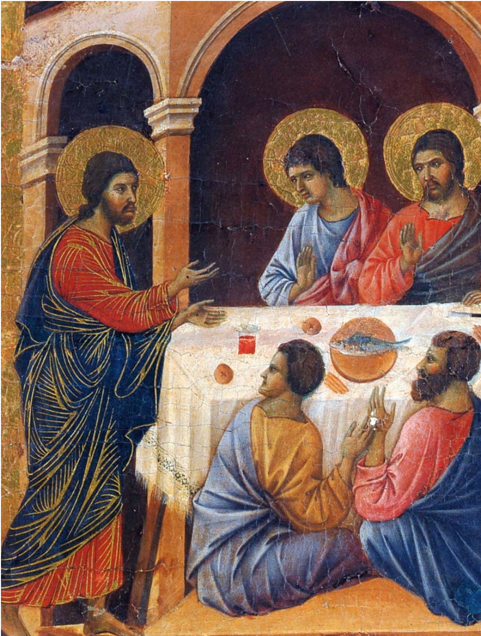
Cover Image: Duccio di Buoninsegna [Public domain], via Wikimedia Commons

2739 STINSON BOULEVARD, ST. ANTHONY, MN 55418