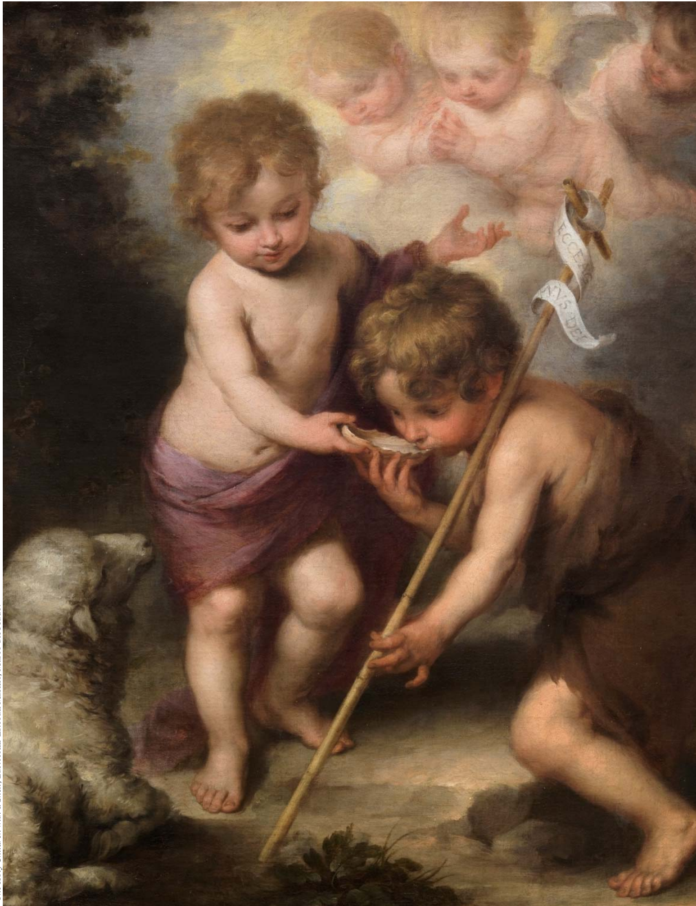
The Holy Children with a Shepherd, Bartolomeo Eschen Murillo, Museo del Prado.

2739 STINSON BOULEVARD, ST. ANTHONY, MN 55418