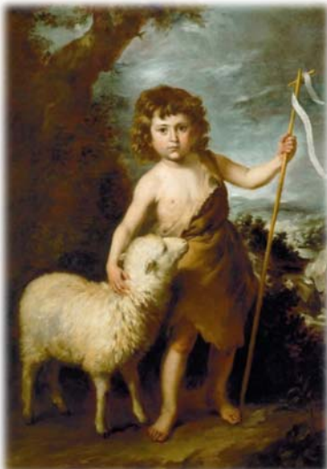
Bartolomé Esteban Murillo, John the Baptist as a Child, 1650.