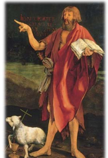
Matthias Grünewald, Isenheim Altarpiece, c. 1515.

(Monsignor Ronald Knox, University and Anglican Sermons, Additional Sermons, 9.)