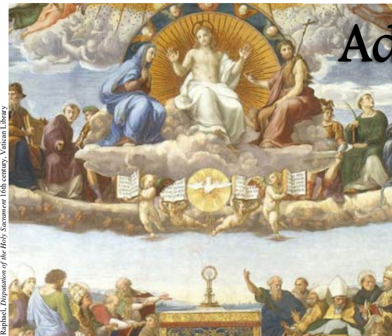
Raphael, Disputation of the Holy Sacrament, 16th century, Vatican Library